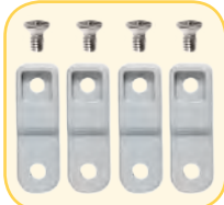
Comes with feet or flanges.

Our Premium Line enclosures are the most durable, aesthetically pleasing, non-metallic Nema UL rated enclosures available. From the extremely versatile mounting options inside the enclosure to having the most off-the-shelf accessories, the Integra “Made In the USA” Premium Line enclosures provide great value to any application.